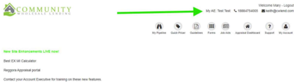
Figure 1. Contact Information